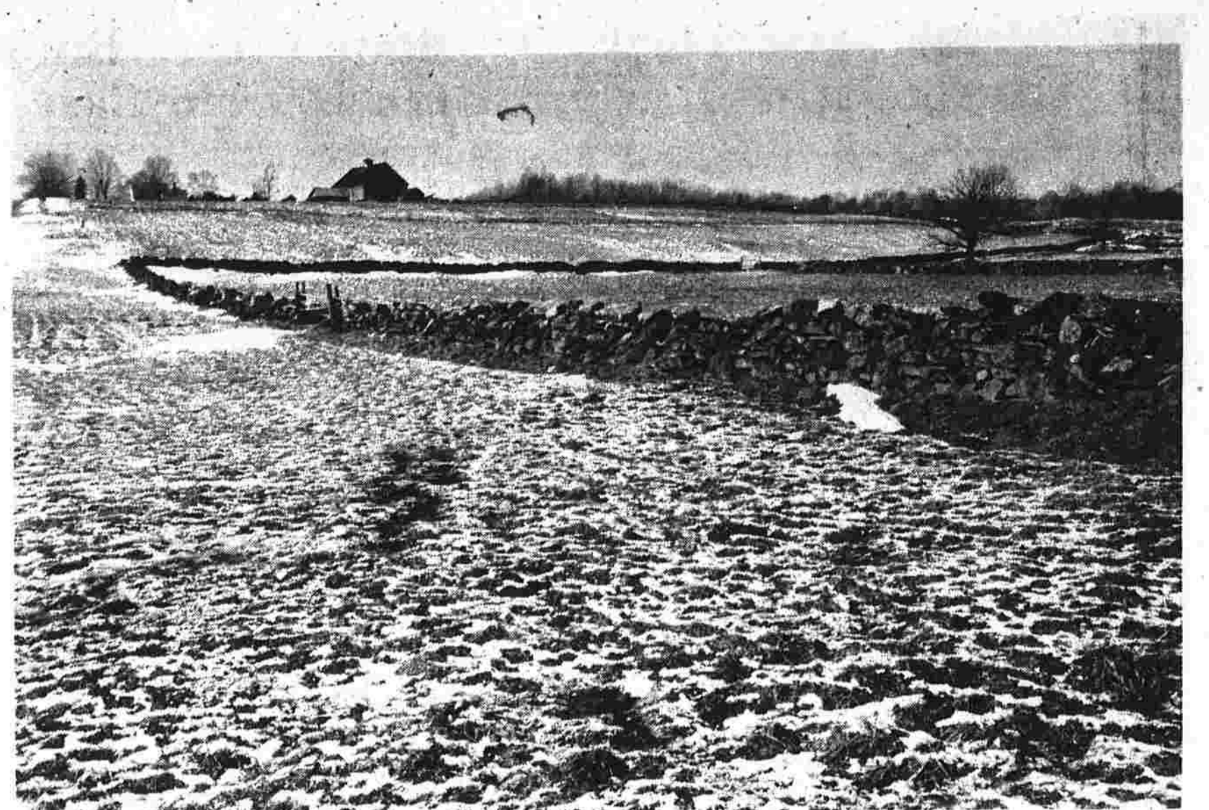
Serpentine Stone Fence in Bolton Area.

A workshop conference on the plan for representatives of state and federal agencies, regional agencies, special commissions, and municipal officials has been conducted. This will be followed up with the state planning agency, in cooperation with regional planning agencies, holding regional meetings throughout the state to discuss the proposals.